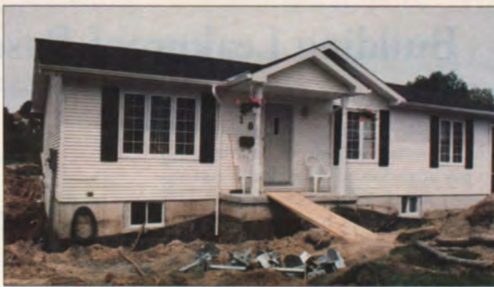
Figure 3. The foundation of this factory home (left) was built on unstable soil. Settlement caused extensive foundation damage (middle), which required complete excavation and engineered underpinings (bottom).

A high water table may result in insufficient foundation support. Excavations below the water table will create a wet hole, which will lead to poor-quality concrete in the footings. If gravel fill is used, the migration of fines will cause foundation settlement.