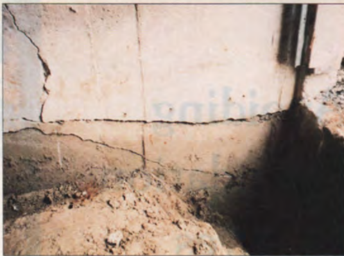
Figure 1. As the soil around an unheated building freezes and expands, it can “grip” the foundation and lift the wall apart (left). Although block walls are particularly susceptible, poured concrete walls can also be damaged (above).

in unheated buildings, like garages (Figure 2). As the soil surrounding the wall freezes and expands, it exerts an upward thrust on the foundation walls, which can result in costly damage.