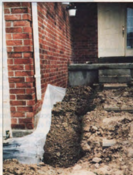
Figure 2. Unheated garages are prone to damage from adfreezing (left). Two layers of 6-mil polyethylene placed on both sides of the foundation wall provides a slip plane that prevents freezing soils from bonding to the foundation wall (right).