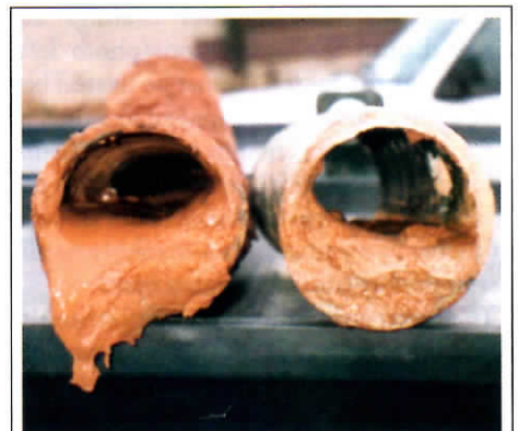
Clogged footing drains can’t do the job. Water draining into the pipe carries silt that eventually fills the pipe. To avoid replacing a clogged footing drain, the author surrounds the pipe with a layered filter that stops sediment.

Waterproof coatings, on the other hand, are a mixture of rubber and asphalt or all