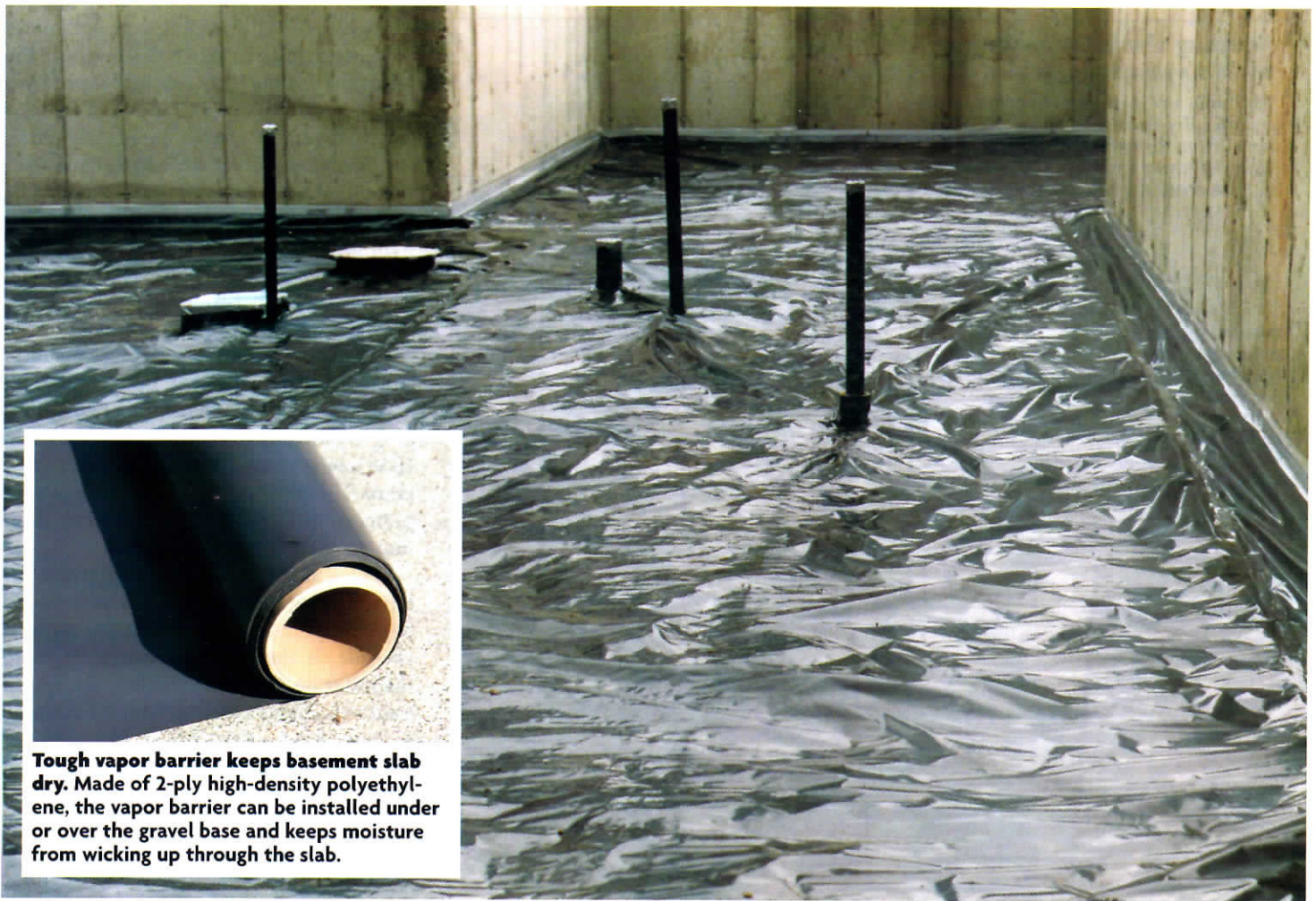
Tough vapor barrier keeps basement slab dry. Made of 2-ply high-density polyethylene, the vapor barrier can be installed under or over the gravel base and keeps moisture from wicking up through the slab.

4 in. instead of the usual 2 in. by 3 in.; this will also drain the gutter twice as fast in a heavy rain. The underground drain itself can be enlarged to a 6-in. dia. if necessary. In the drain, it's best to avoid 90° bends, which trap leaves and gunk, and use 45° bends instead. If there's a long run of gutter, give it two outlets. Finally, never connect the gutter drains to the footing drains, no matter how far downstream. Gutter drains are always voted "most likely to clog" and will back up the footing drains, too.