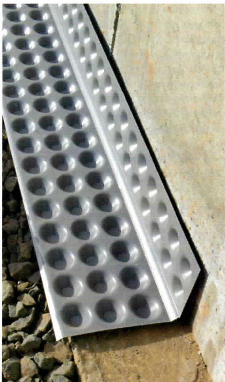
Drainage flashing is a simpler, less expensive interior drain. Installed at the junction of wall and footing, this flashing has a dimpled profile that allows any water from the walls to flow beneath the slab and into the sump pump. Obviously, it's important to keep the top of the flashing clear when pouring the slab (photo right).

or you can contact my company, Basement Systems, at (800) 541-0487.