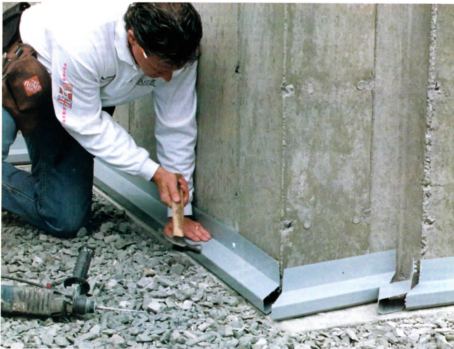
Interior perimeter drains are good insurance in new construction or retrofits. Plastic drains on top of the footing collect water that leaks in through the walls and channel it to the sump pump. The entire drain is to be covered with concrete, except the opening facing the wall.

rubber (sometimes called elastomeric ) and can cost three times as much. Like damp-proof coatings, waterproof coatings are sprayed onto the foundation (photo left, p. 64), but the material must be heated before application; it's also applied in a thicker coat and is elastic enough to bridge \frac{1}{16} -in. wide cracks and small holes. The key to the waterproofing's performance is the amount of rubber in the mixture; more rubber means better performance and higher costs.