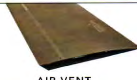
AIR VENT The Edge Vent