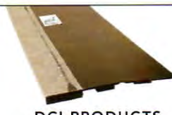
DCI PRODUCTS Smart Vent (installed above)