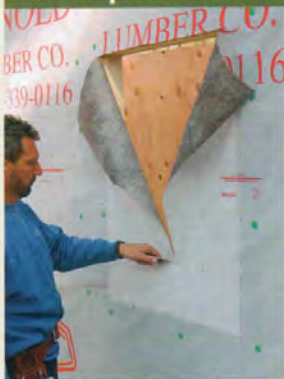
First, cut across the header, then down the center.