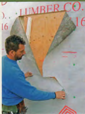
Make a horizontal cut and two angled cuts to the sill.