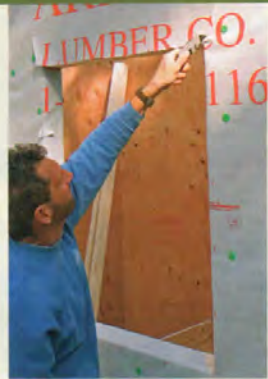
Staple the tabs down, then cut the top tab.