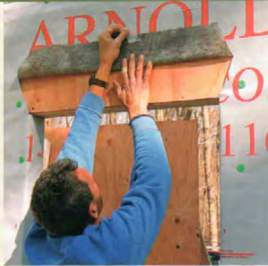
Fold up the top tab, and tape it out of the way.